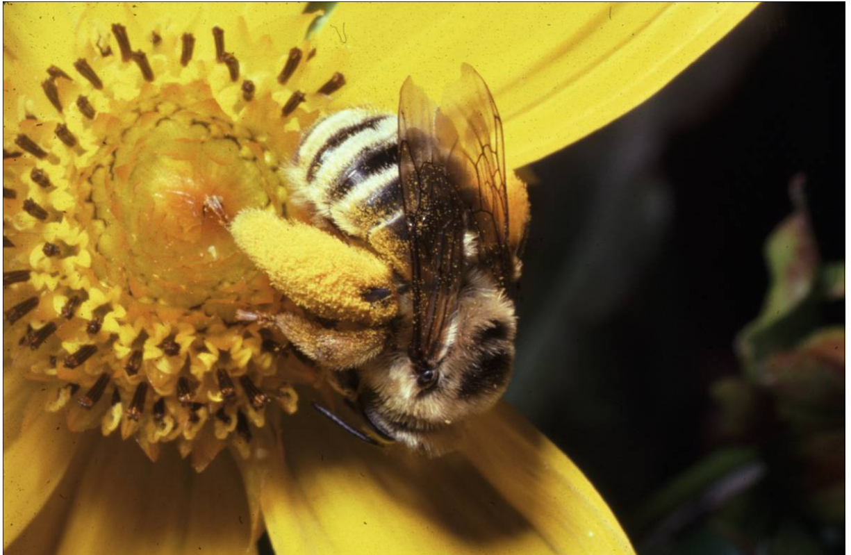
Melissodes bee foraging on sunflower.

Patches of flowers can be grown almost anywhere and will form an important food resource for bees.