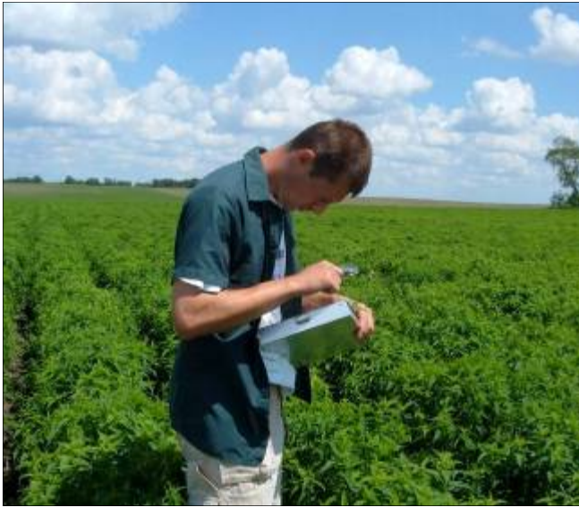
Crop scouting reduces pesticide applications. Treatments are only made when threshold levels are met.

bees and consequently be brought back to the nest resulting in larval as well as adult mortality.