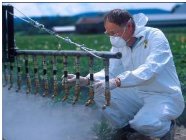
Spray drift can be a significant threat to bees and other pollinators foraging in habitats near crop fields. Correct nozzle calibration is one way to reduce drift and maintain accurate application of pesticide sprays.

The best application times are when crops (or immediately adjacent weeds and cover crops) are not in bloom. Where insecticides must be applied near blooming plants, select the product with the lowest residual toxicity and spray during the late evening when bees are not actively foraging. Keep in mind that pesticide residues may persist longer on wet foliage, so dewy conditions should be avoided. For more information on applying pesticides safely, see Farming for Bees: Guidelines for Providing Native Bee Habitat on Farms (see References for details).