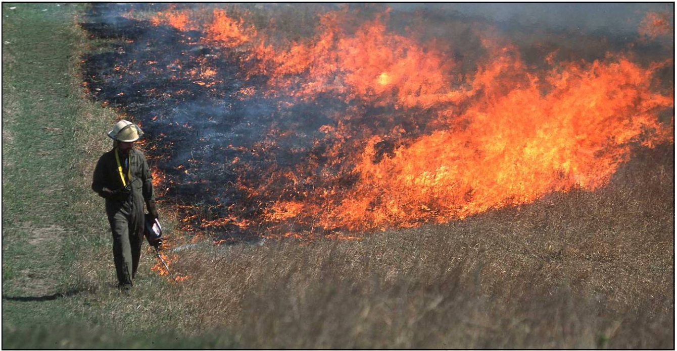
Fire can be an important management tool for managing or restoring native prairies.

turn encouraged butterflies. The author recommends a cautious approach to prescribed burning to ensure that a range of habitat heterogeneity is maintained or restored.