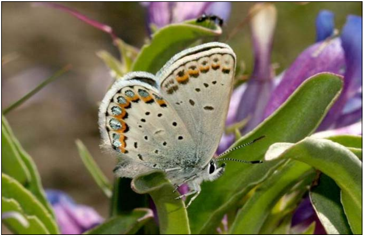
Anna's northern blue.

Incorporating pollinator needs into a site management plan will result in excellent habitat for wildlife of all types.