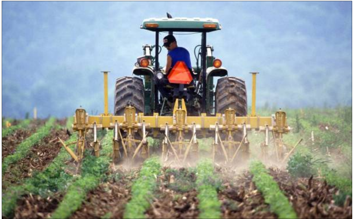
An essential activity on farms, tillage can impact beneficial insect populations.

An awareness of the needs of native bees will help farmers balance production practices with efforts to conserve this vital resource.