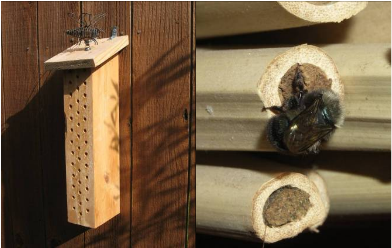
Two styles of tunnel nest: a wooden block (left) and a stem bundle (right, being sealed by a mason bee). The wooden block can be redrilled and washed to maintain nest hygiene. The stem bundle must be disposed of after a couple of years and replaced.

achieve the 3-inch minimum recommended depth. If that is the case, simply drill as deeply as you can; bees that use tunnels of smaller diameters will often nest successfully in ones that aren't as deep.