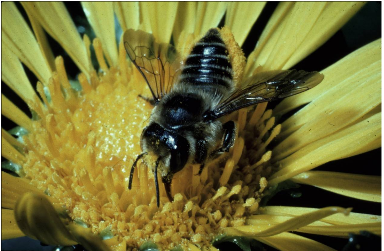
Leafcutter bee foraging on gumweed.

Patches of flowers can be grown almost anywhere and will form an important food resource for bees.