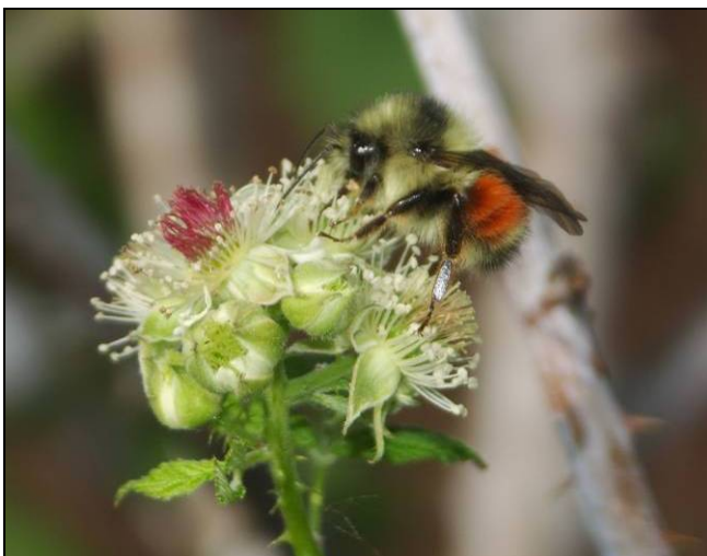
Pollinators are a vital component of our ecosystems. Planning management with them in mind will help create a healthy environment.

Those applying insecticide should be aware of butterfly hostplants in the management area and avoid spraying on or around them. If a managed area is known to host rare or specialist pollinators, ensure that adequately buffered habitat refugia are available during and after insecticide application.