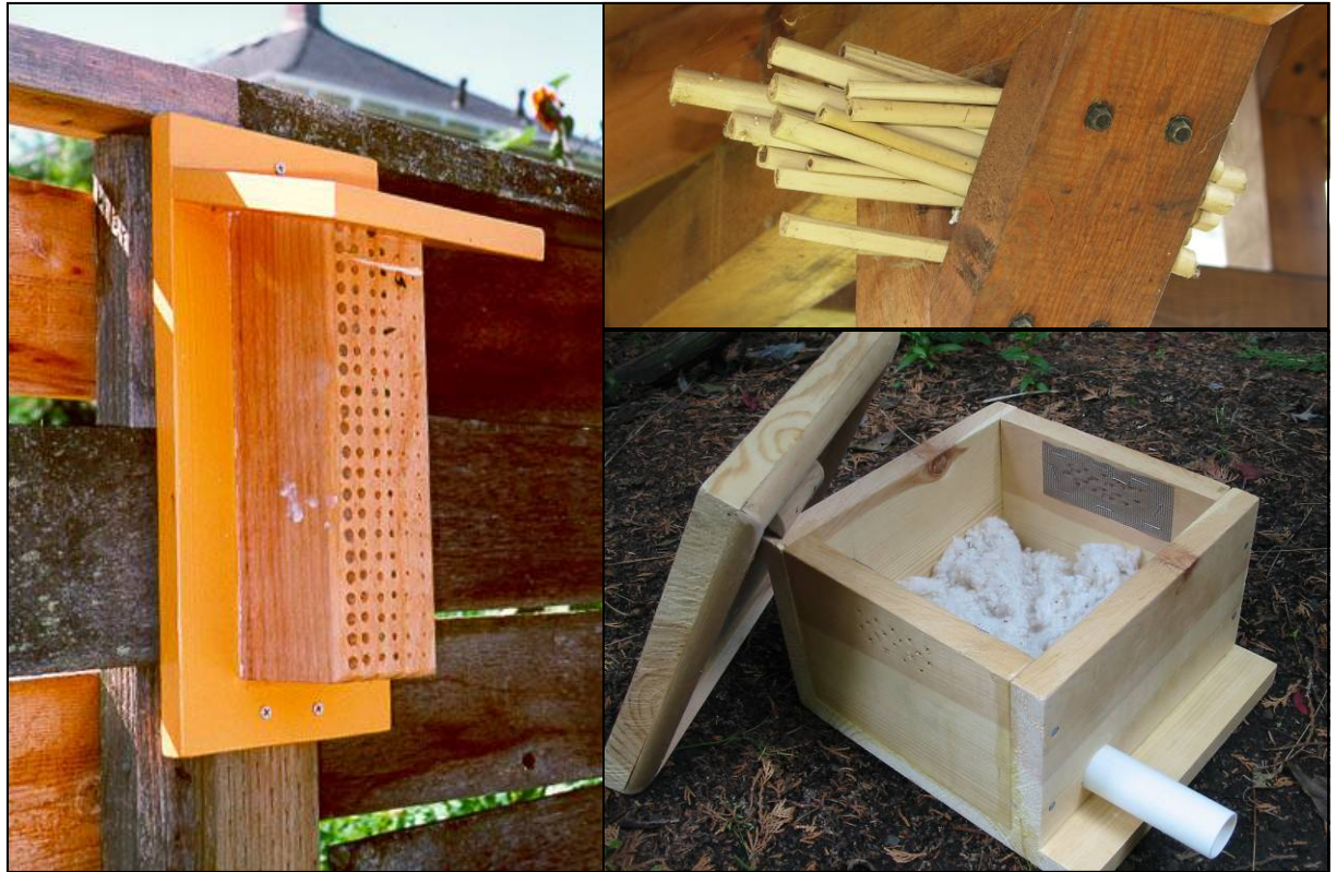
A selection of home-made bee nests: (clockwise from left) wooden block, bamboo bundle, and bumble bee box.

Nest sites are simple to make, and can be added to any area of greenspace, large or small.