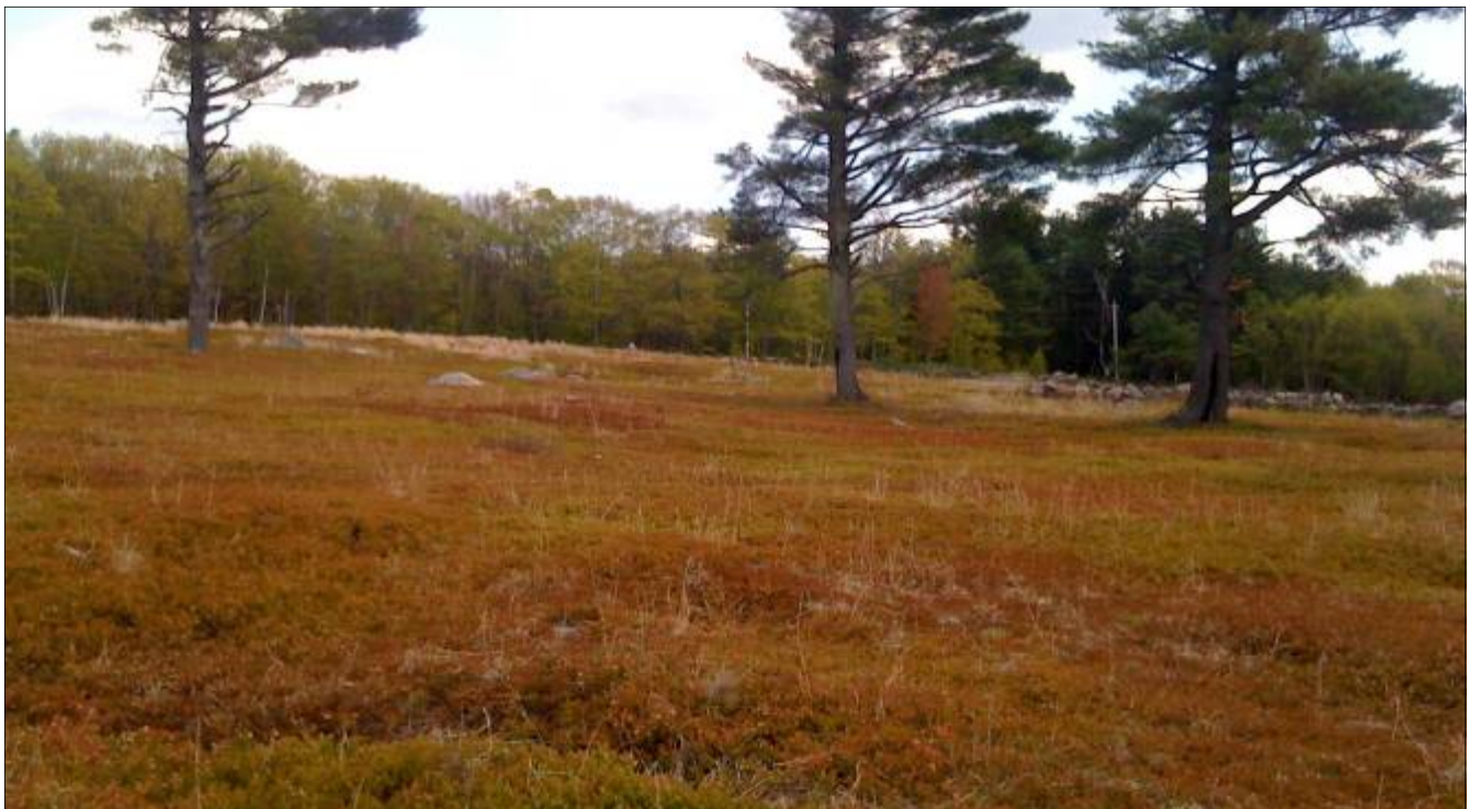
Dozens of species of native bee pollinate flowers on the low-bush blueberry barrens in the Northeast United States and southeast Canada. Protecting these insects from pesticides is important to maintain large harvests.

EPA (U.S. Environmental Protection Agency). 1995. Re-registration Eligibility Decision: Gibberellic Acid . 738-R-