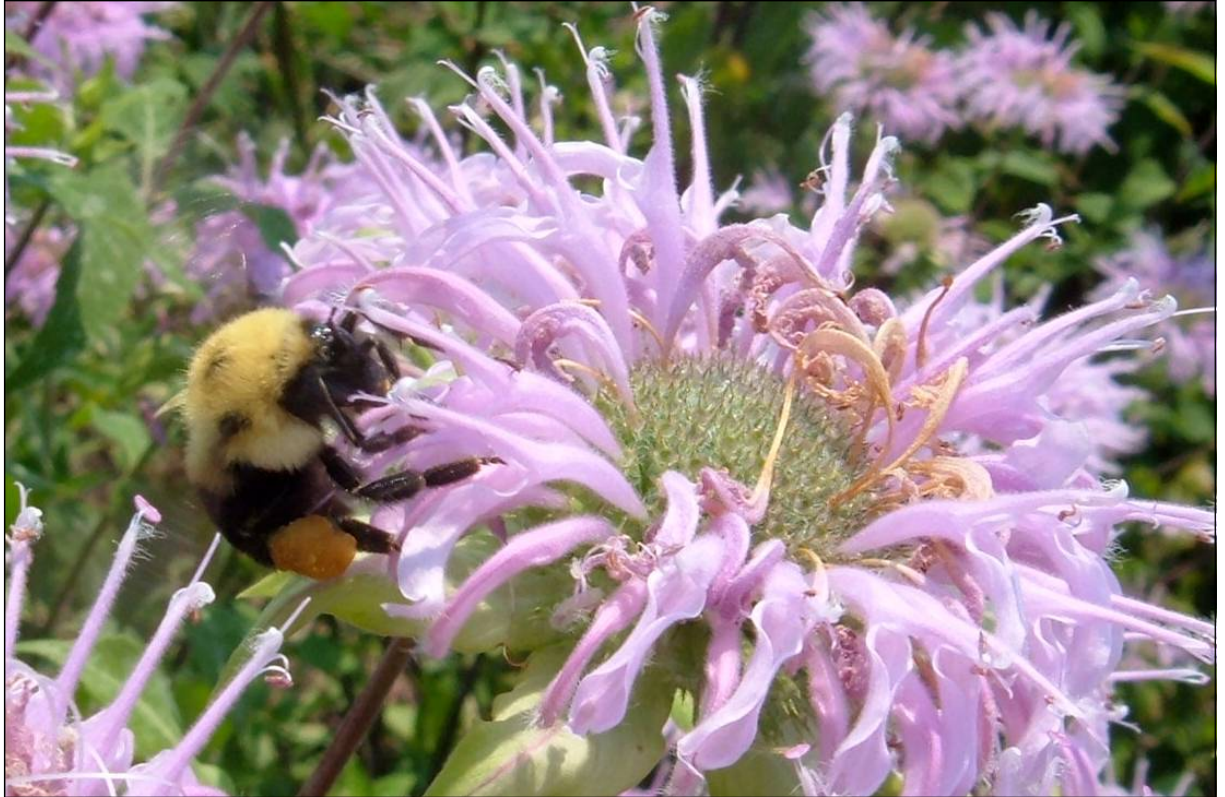
Bumble bee foraging on beebalm.

Patches of flowers can be grown almost anywhere and will form an important food resource for bees.