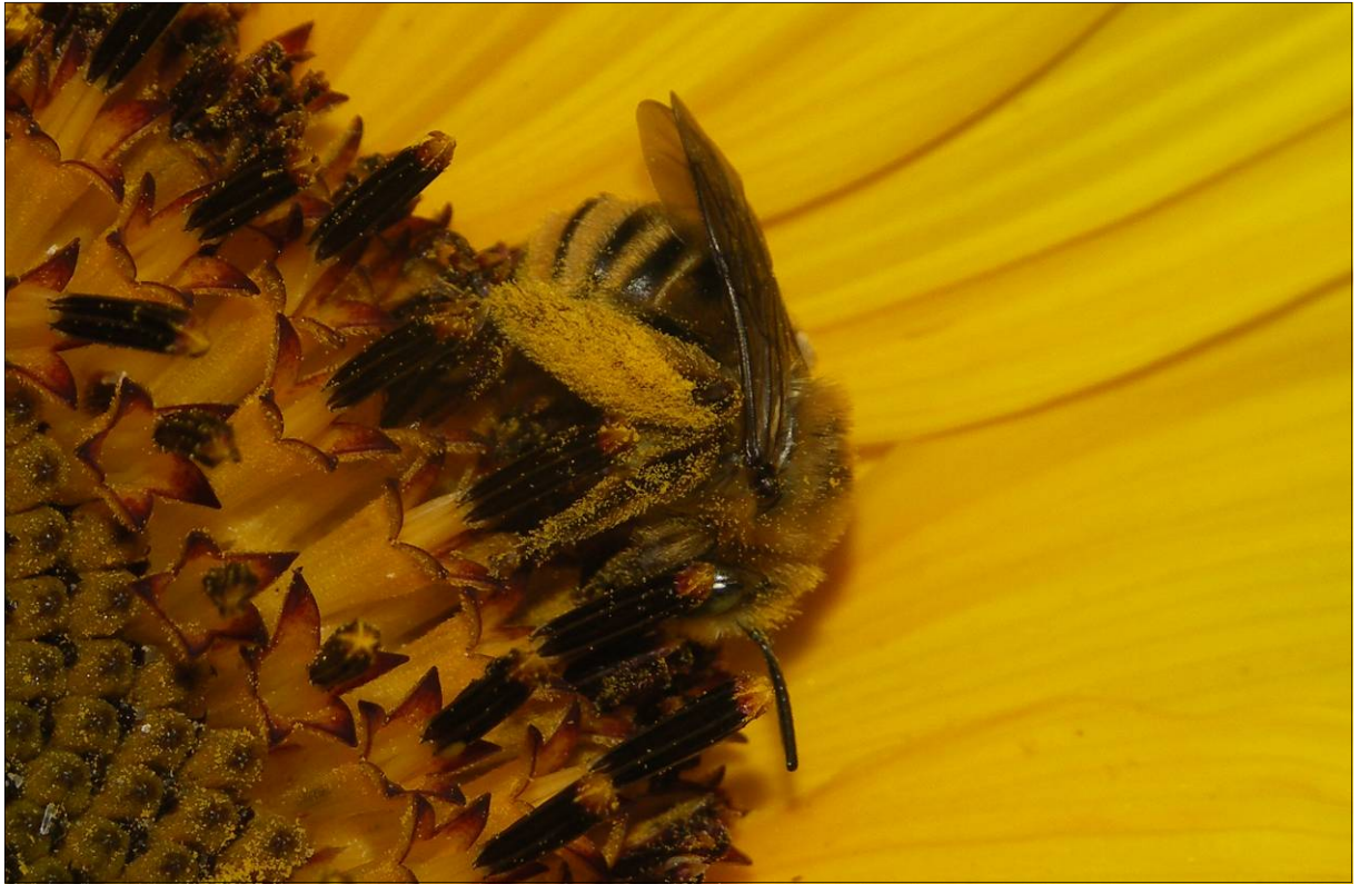
Longhorn bee foraging on sunflower.

Patches of flowers can be grown almost anywhere and will form an important food resource for bees.