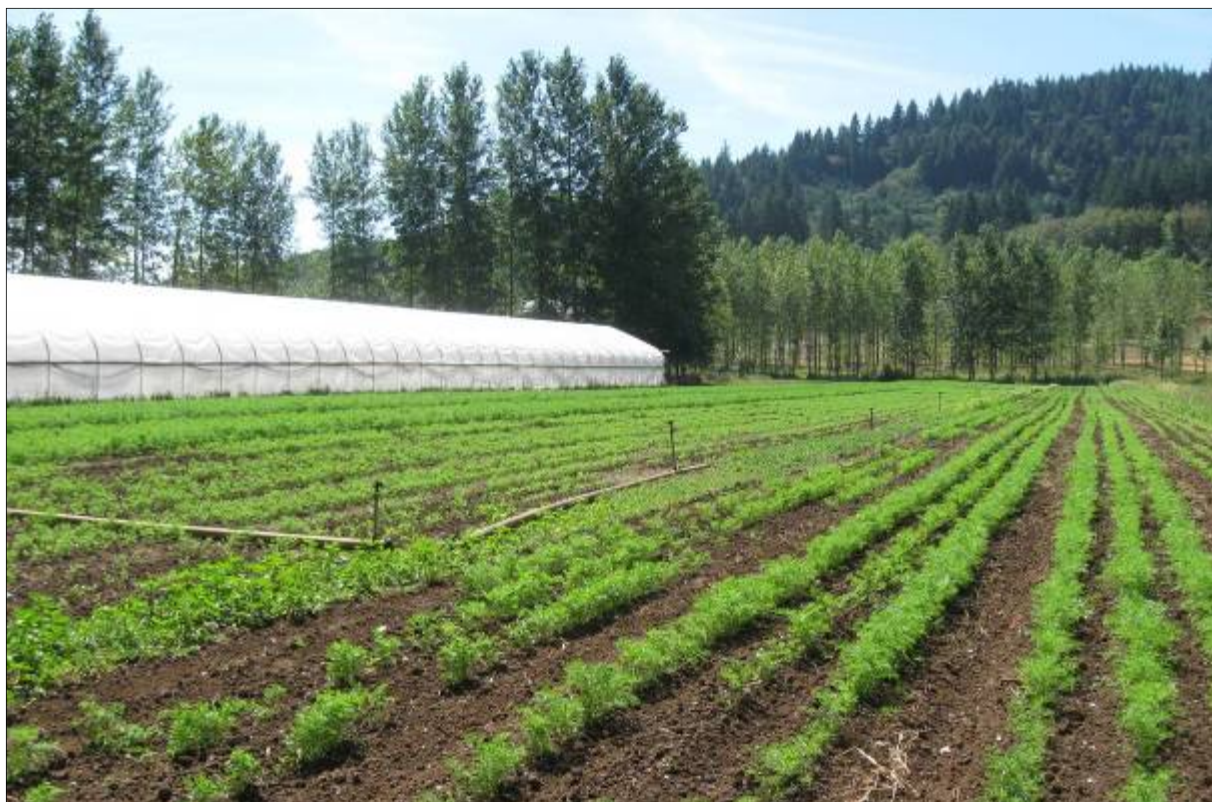
Productive cropping systems do not have to rely on chemical inputs for pest control.

By selecting the least toxic options and applying them when pollinators are not present, harm can be minimized.