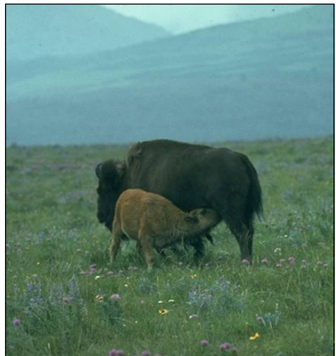
While the ecological impact of overgrazing can be severe, moderate levels of rotational grazing may provide some positive benefits.