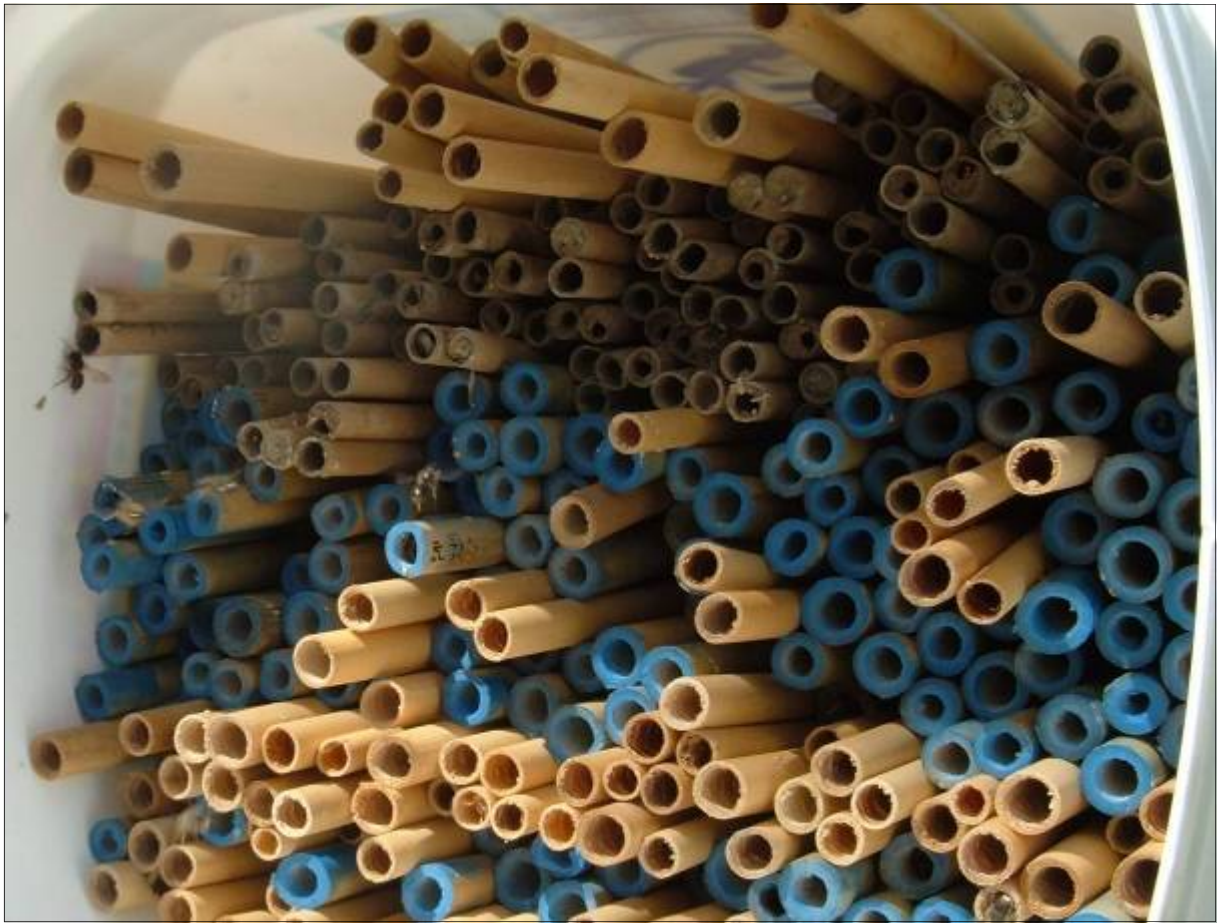
Artificial nest sites like bamboo tubes in a plastic bucket are effective, but need maintenance.

However, keeping the nests clean is important to limit disease build-up and maintain healthy bee populations.