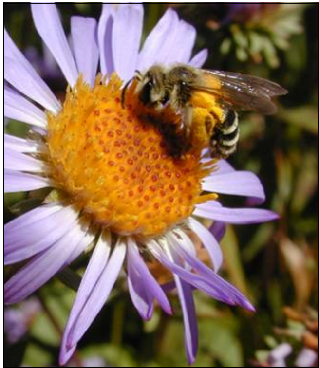
Bees and other pollinator insects are not only important for natural areas, but also bring great benefits to nearby farms and gardens. Photograph of mining bee (genus Andrena ) by Bruce Newhouse.

Pollinators perform such a range of ecological services in natural ecosystems that they are clearly a keystone group in nearly all terrestrial ecosystems, necessary for plant reproduction and in forming the basis of an energy-rich food web (Kearns et al. 1998).