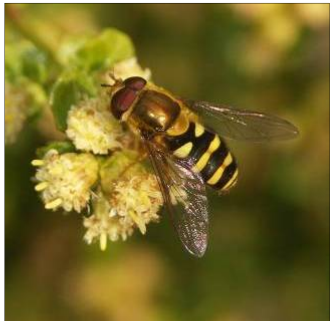
Conservation biological control focuses on ensuring there is adequate habitat to support populations of predatory insects, such as this syrphid fly. Syrphid flies eat aphids both as adults and larvae.

Trap Crops: Some growers intentionally place plants that are highly attractive to pest insects adjacent to less attractive crops to draw pests away. An example is eggplant planted as a trap crop near tomatoes and peppers, or serviceberry maintained as a plum curculio weevil trap crop near apples. In many cases, growers then apply insecticides to the trap crop to control pest populations. If this strategy is used, avoid spraying trap plants that are in bloom, and apply insecticides in the late evening when pollinators and predatory insects may be less active.