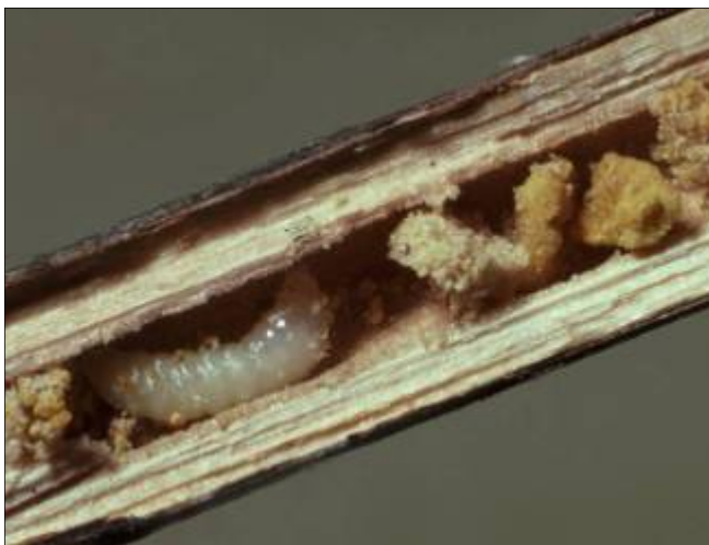
About 30 percent of North America's bee species nest in tunnels, generally abandoned beetle borings in a snag or, as here, the center of a pithy twig. The female bee divides the tunnel into a series of brood cells, each one supplied with nectar and pollen. Small carpenter bee (genus Ceratina )

Depending on the species and climate, there may only be a single generation of bees per year (univoltinism), or multiple generations per year (multivoltinism). Some species may also have parsivoltine lifecycles, laying dormant for over a year, waiting for the appropriate weather conditions to spur their emergence. The latter lifecycle is most commonly observed at high elevations, in deserts, areas prone to forest fires, and other extreme environments.