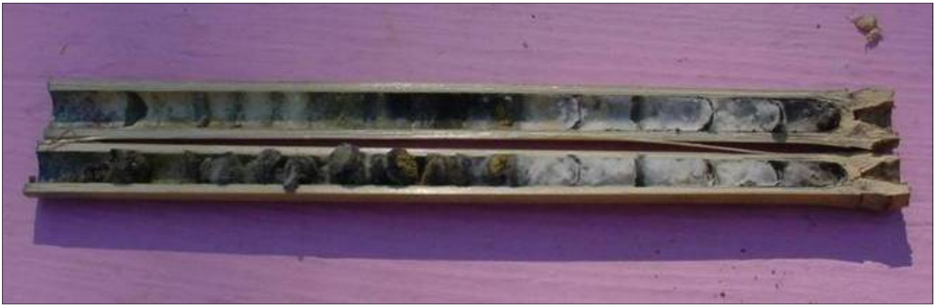
Artificial nest sites lead to bees nesting in densities seldom reached in naturally, and pests and diseases can proliferate unless the nests are carefully maintained. This bamboo stem has been infested with chalkbrood; none of the bees survived.

emerges from a contaminated nest tunnel.