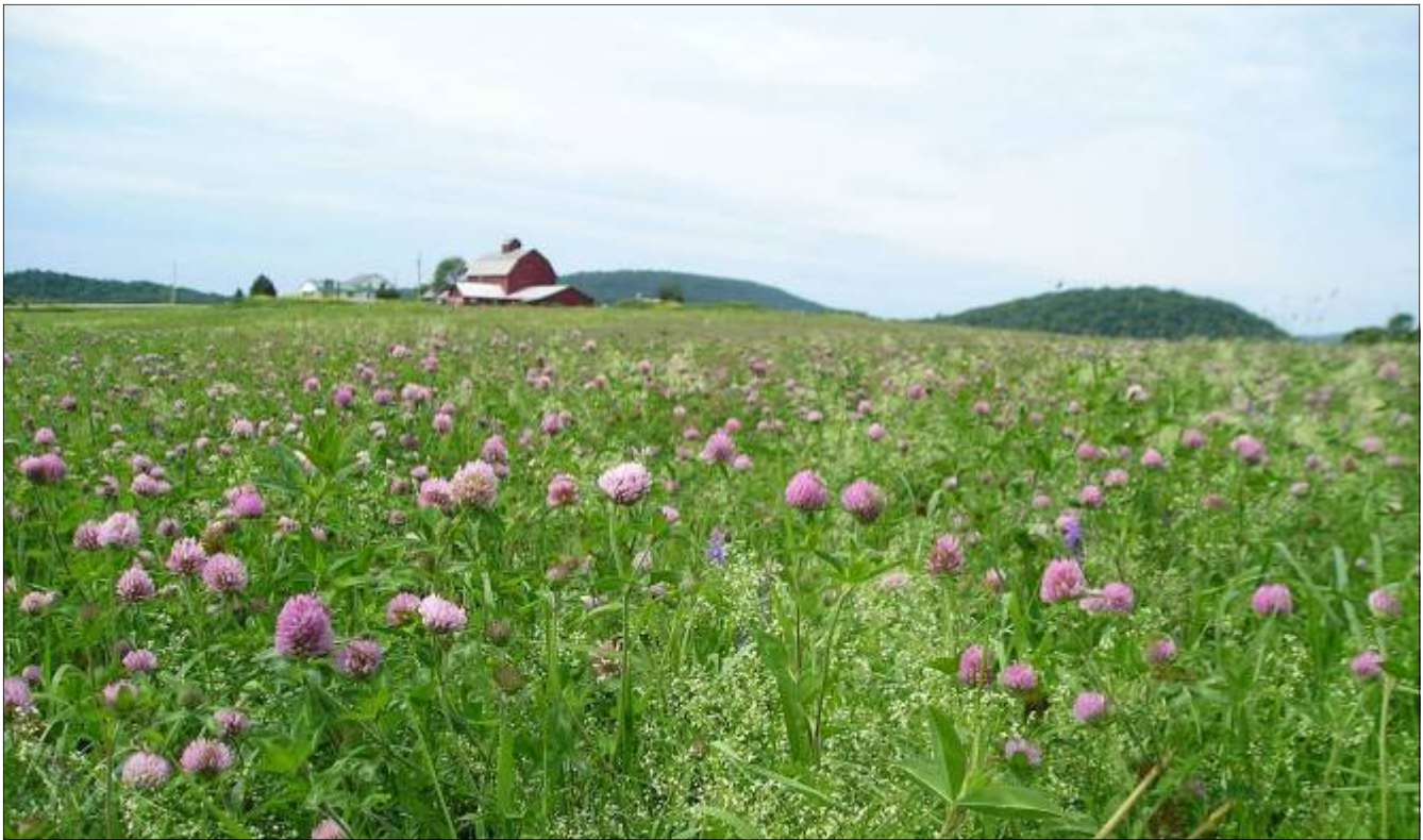
Cover crops offer several benefits: they build soil fertility and tilth, disrupt pest populations when used in rotation, and they can provide an alternative source of forage for pollinators. Red clover cover crop photographed by Toby Alexander, USDA-NRCS.

Sanitation: Removal and disposal of crop residue at the end of the season can reduce pest populations, and thus reduce the need for pesticides. Sanitation can include the removal of nearby alternate host plants for crop pests. Excessively clean landscapes on the other hand may remove potential nest sites (such as hollow stems) for solitary bees. Where possible, aim for a balance between clean fields and adjacent natural habitat.