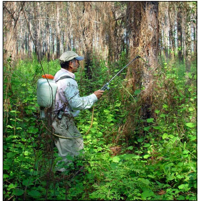
Wherever herbicides or insecticides are applied, use the most targeted method possible.

Herbicide applications should be specific enough to avoid spraying nontarget forage plants and hostplants.