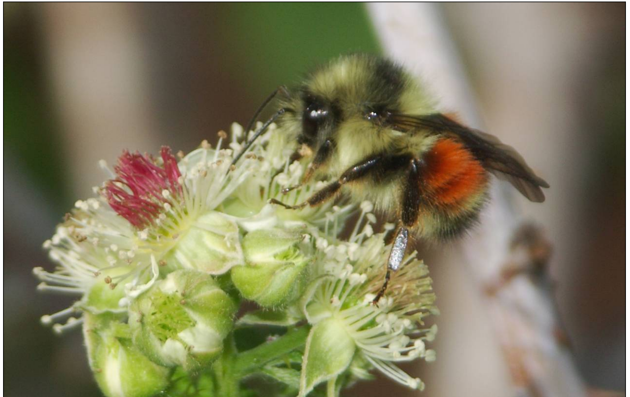
Bumble bees are important pollinators of raspberry and other cane crops

Native bees can buffer against honey bee losses.