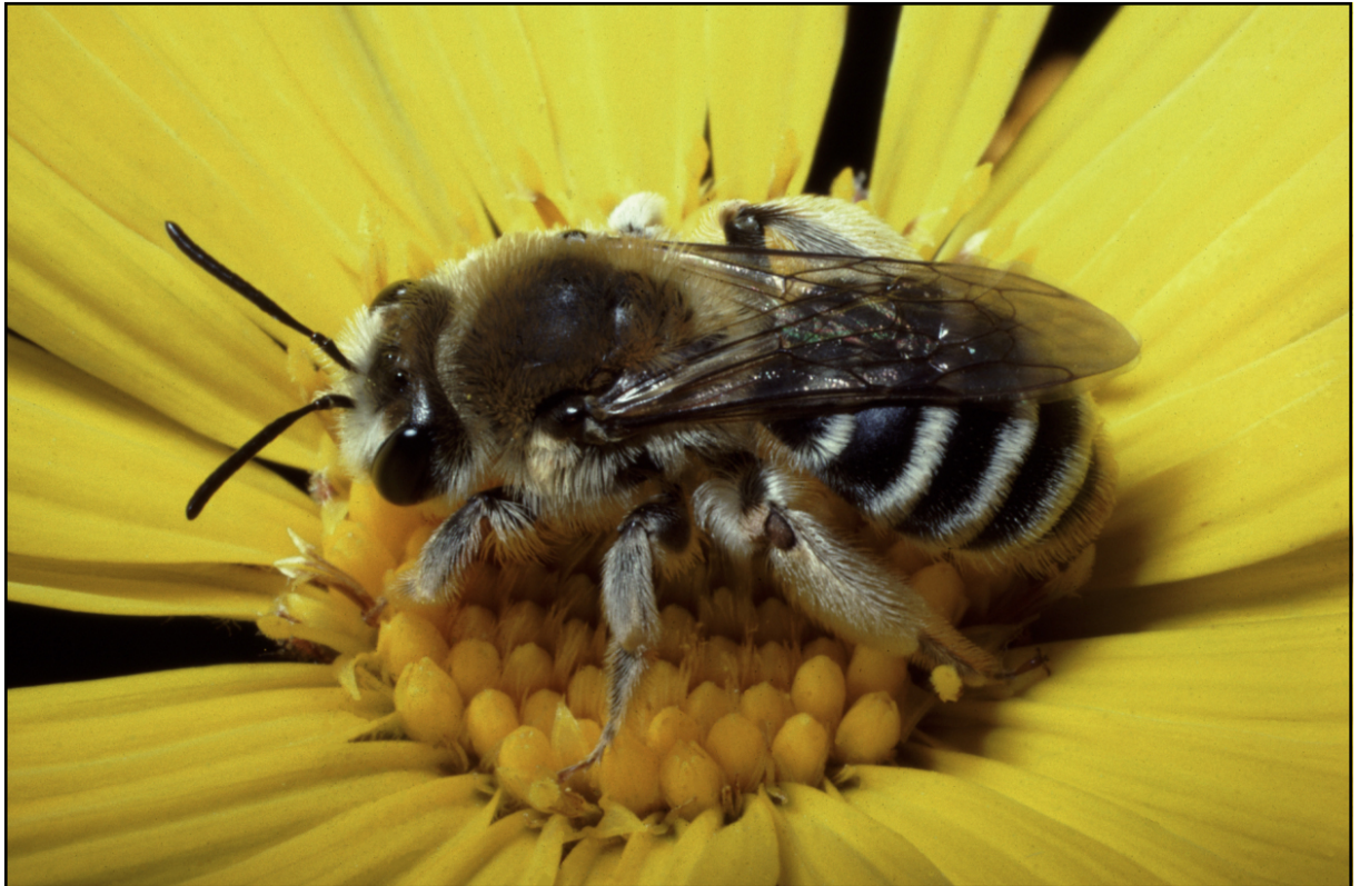
Mining bee foraging on sunflower.

Patches of flowers can be grown almost anywhere and will form an important food resource for bees.