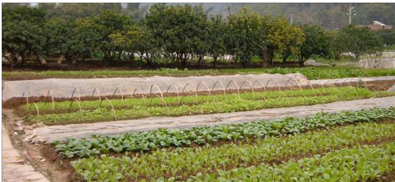
Physical barriers such as plastic mulch or row covers offer control of weeds or insects. However, smothering the ground may prevent nesting by ground nesting bees and covers can hinder predation of pests by beneficial insects.

Straw/Wood Mulch: As with plastic mulch, straw or wood mulch may limit soil access for ground nesting bees. However, emergence by dormant underground bees should still be possible. In addition, thick layers of organic mulch may provide nest sites for bumble bees, or even potential hibernation sites for overwintering bumble bee queens.