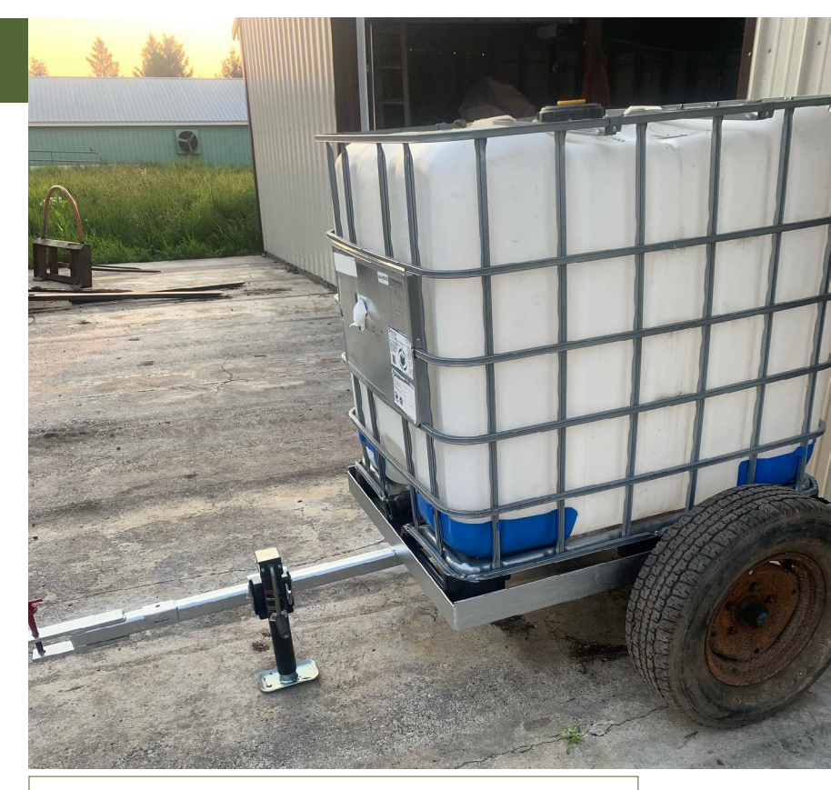
A movable water trailer at Shady Side Farm.

At Shady Side Farm, watering systems for livestock are moved around the farm on trailers. "We don't have dedicated water lines around here," Mike explained. "Our infrastructure is trailered water. With trailering water we don't end up with mud holes or livestock areas where they're wearing out the pasture. Because we'll come back to a pasture two or three times in a summer with a group of animals, we want to move those water areas so we don't have worn out areas in the fields. So water tanks on trailers help us get the water to where the animals are, keeping it fresh on a daily basis."