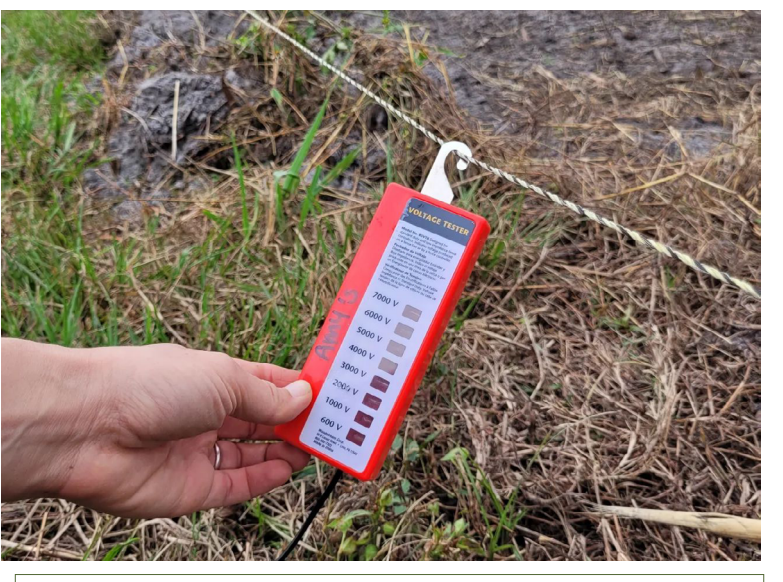
Testing electric fencing is done twice daily at Frog Song Organics by staff trained to monitor and troubleshoot the system.

Maintaining electric fencing becomes an essential part of farm life for any ICLS that utilizes it. At Frog Song Organics, testing and maintaining portable electric fencing is a task that is done twice a day by staff fully trained in how the entire system works. Training staff to understand how electricity flows and how to troubleshoot in the field has become a part of employee training, and the added focus has helped the farm's overall efficiency.