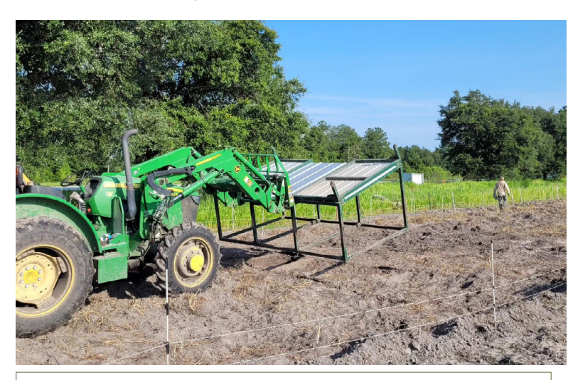
Mobile pig housing at Frog Song Organics is built so that it can be moved by a front-end loader. Note that each end of the roof can be flipped back, shortening the width of the structure during transport.