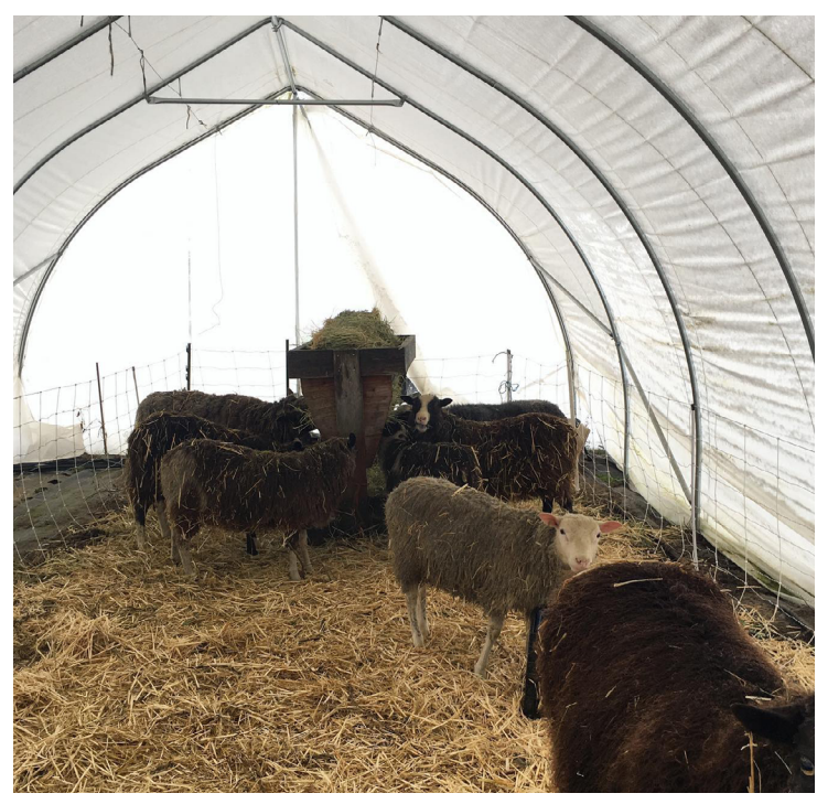
A caterpillar tunnel provides winter housing at Local Color Farm and Fiber.